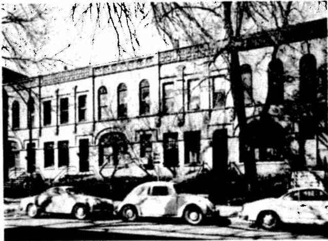
The five houses at 1826-34 North Lincoln Park West were designed by Louis Sullivan.